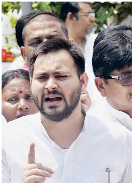
Bihar deputy chief minister Sushil Modi (left) arrives for the floor test at Bihar Vidhan Sabha in Patna on Friday. Former deputy CM Tejashwi Yadav (above) speaks to the media in Patna on Friday.

Regarding allegations on the Swarna Bharati Trust, run by his daughter, Mr Naidu said it had been functioning for 16 years and that it did not accept funds from the government. Mr Naidu said his daughter had told him that they did not take foreign funds.