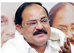
M. Venkaiah Naidu

Reacting to Congress leader Jairam Ramesh's allegations about his children being favoured, Mr Naidu said that he had never interfered in his children's businesses. He said such allegations were inescapable in public life. "Those