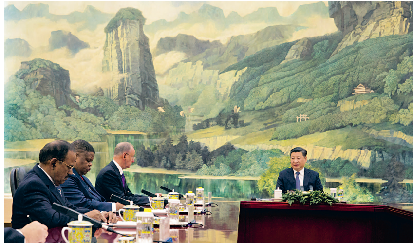
National security adviser Ajit Doval with Chinese President Xi Jinping at the Great Hall of the People in Beijing on Friday.

It said that the order declaring Naik a proclaimed offender was issued recently by a special court in Mumbai, after which the process of attachment of his assets 'under section 83 of the Criminal Procedure Code (CrPC)' has been initiated. Naik is being probed under terror and money-laundering charges by the NIA. He fled from India on July 1, 2016, after terrorists in neighbouring Bangladesh claimed that they were inspired by his speeches on waging a 'jihad' (holy war). According to the 'Middle East Monitor', an online news portal, Naik has already been granted citizenship by Saudi Arabia. — PTI