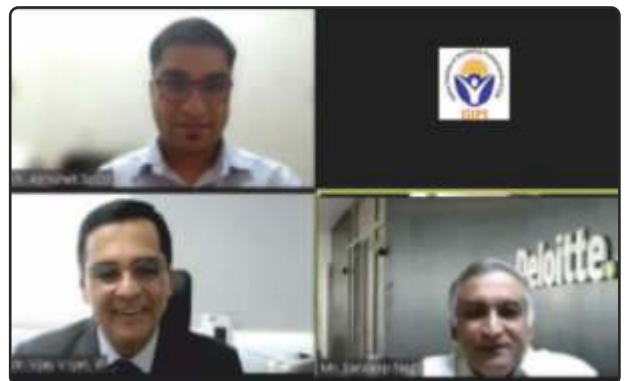
Webinar on Successful CIRP Case Study- Bhushan Steel Limited Organized on April 08, 2022.