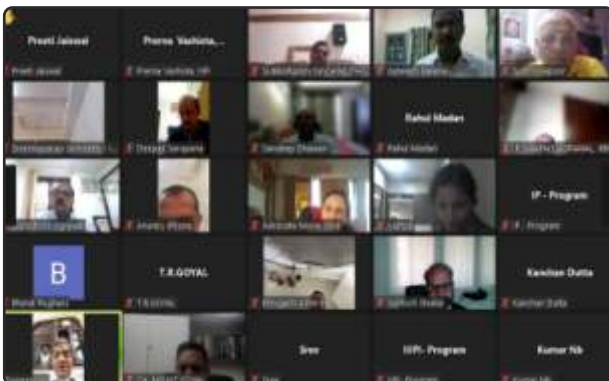
A snapshot of 7 th Batch of EDP on Managing Corporate Debtors as Going Concern under CIRP from 26 th April 2022 to 30 th April 2022.