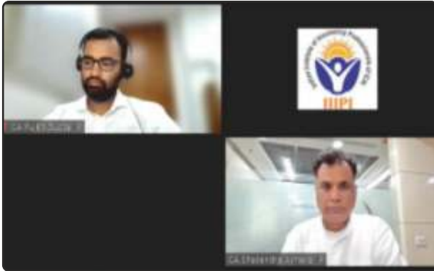
A snapshot of Webinar on “Case Study on Ruchi Soya Industries Ltd.” organized by IIIPI on May 05, 2022.