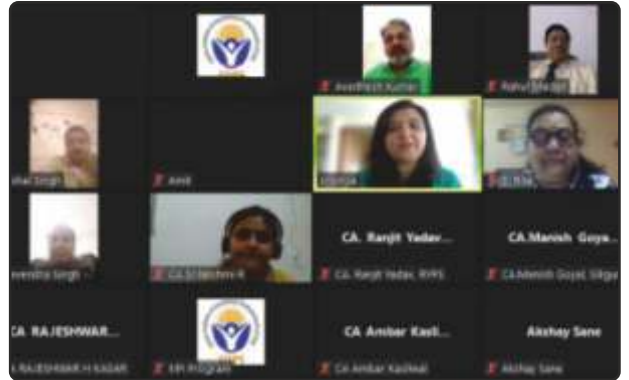
LIE Preparatory Classroom (Virtual) Program was organised by IIIPI jointly with Committee on IBC, ICAI from April 22, 2022. The "Weekend Batch" was conducted over five weekends while "Weekday Batch" was from 17th to 21st May 2022.