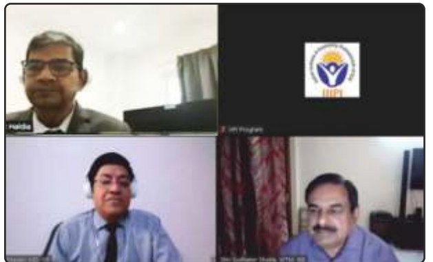
Webinar on “Avoidance Transaction under IBC - Best Practices” organized by IIIPI on April 15, 2022.