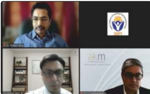
A snapshot of the Webinar on “Corporate & Ancillary Law: Know How of IPs” organized by IIIPI on April 28, 2022.