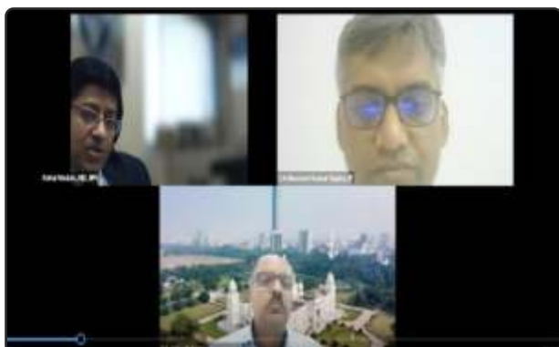
A snapshot of the Webinar on “Ethics in Insolvency Profession” organized by IIPI on May 27, 2022.