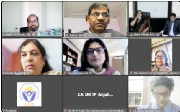
Webinar on “Contribution of Women IPs under IBC: Potential Issues and Challenges” organized by IIIPI on the occasion of International Women’s Day on March 06, 2023.