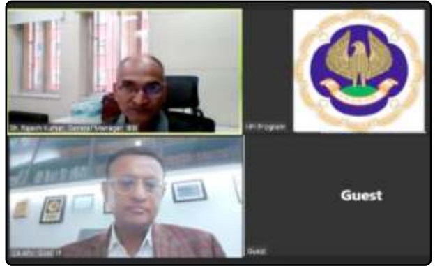
Webinar on “Proposed Amendments in IBC” organized by IIIPI on February 10, 2023.