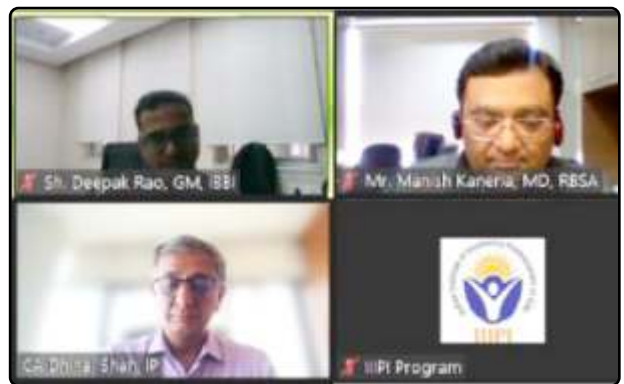
Webinar on “Valuation under IBC- Guidance for IPs” organized by IIIPI on February 03, 2023.