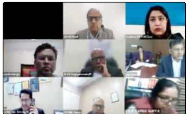
IIIPI jointly with IIP-ICSI and IPA of ICMA organized a Webinar on “Recent Amendments Relating to Regulatory Fee” on January 30, 2023.