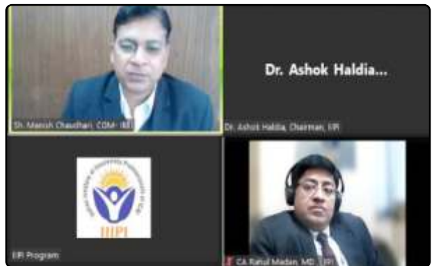
Webinar on “Common Issues on Monitoring/Inspection & and Peer Review & Mentorship Frameworks” organized by IIIPI on January 09, 2023.