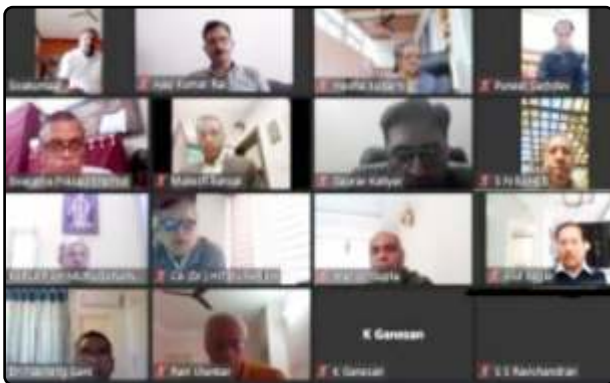
IIIPI’s 6 th Batch of Executive Development Program (For IPs) Mastering “Avoidance/PUFE Forensics” Under IBC (Online) from 23 rd to 25 th January 2023.