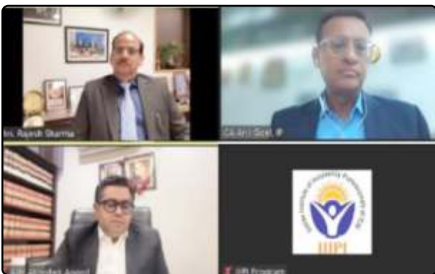
Webinar on “Liquidation Process – Grey Areas & Best Practices” organized by IIIPI on January 13, 2023.