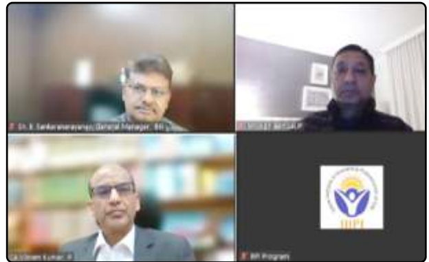
Webinar on “Value Maximization Strategies Under IBC” organized by IIIPI on March 10, 2023.