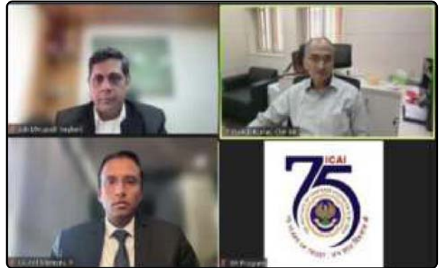
Webinar on “Interface with Statutory Authorities/ Enforcement Agencies” conducted by IIIPI on October 27, 2023.