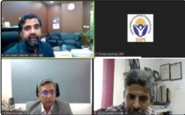
Webinar on ‘Best Practices - Appointment of Professionals & CoC Meetings’ conducted by IIIPI on Sept. 29, 2023.