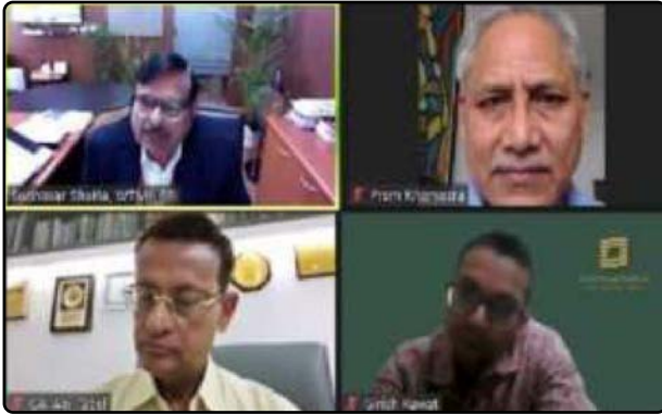
Webinar on “Issues faced by Real Estate Allottees under IBC” conducted by IIIPI on November 03, 2023.