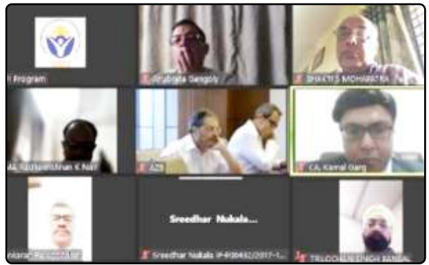
08th Batch Executive Development Program (EDP) “Mastering Avoidance/Pufe Forensics under IBC” conducted by IIIPI from 20th to 22nd November 2023.