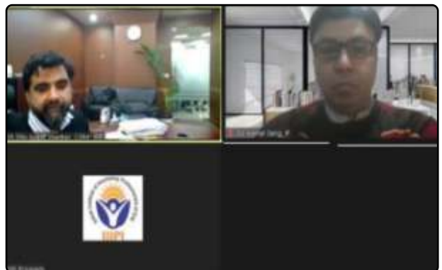
Webinar on ‘Avoidance Transactions-Improving Outcomes’ organized by IIIPI on January 25, 2024.