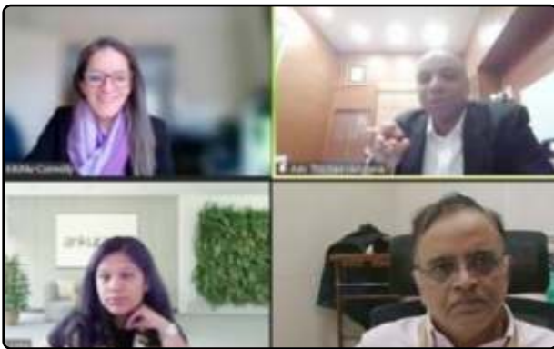
Webinar on “PG to CD Insolvency – Recent Hon’ble SC Judgement” conducted by IIIPI on December 12, 2023.