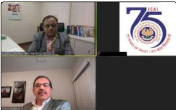
Webinar on “Evolving Jurisprudence under IBC – Important Case Laws” organized by IIIPI on December 29, 2023.