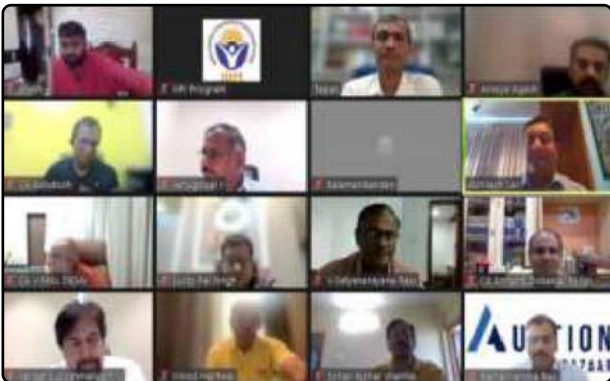
Limited Insolvency Examination- Preparatory Classroom (Virtual) Program- Sept. & Oct.2023 Batches, organized by IIIPI.