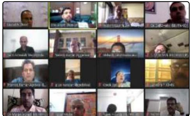
15th Batch of EDP (For IPs) on Managing CDs as going concern under CIRP (Online), organized by IIIPI from 10th to 14th Oct. 2023.