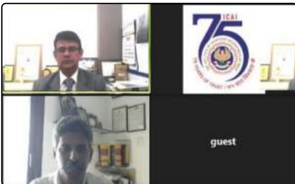
Webinar on ‘Pre-Pack Insolvency Resolutions for MSMEs’ jointly organized by IIIPI with WASMEs on January 12, 2024.