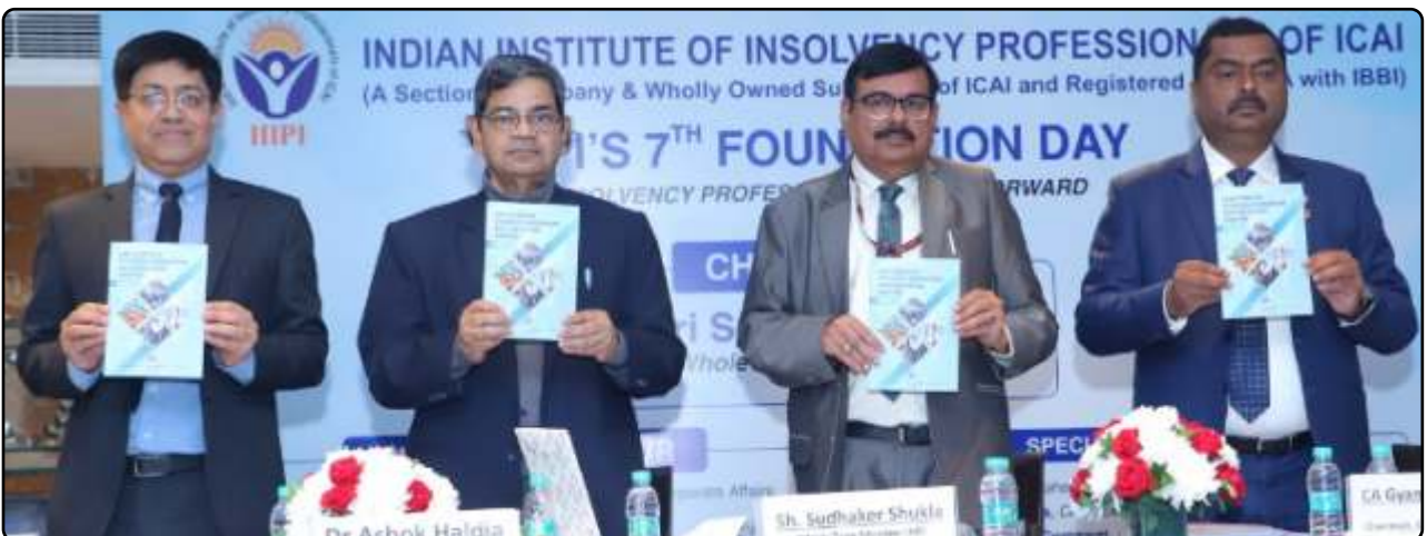
Release of the publication titled “Case Studies of Successful Resolutions and Liquidations under IBC – Series 2” during the Conference on “Insolvency Profession – The Way forward” (Physical Mode) on the occasion of the 7th Foundation Day of Indian Institute of Insolvency Professionals of ICAI (IIIPI) in New Delhi on December 06, 2023.