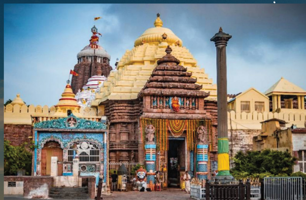
Shri jagannath temple