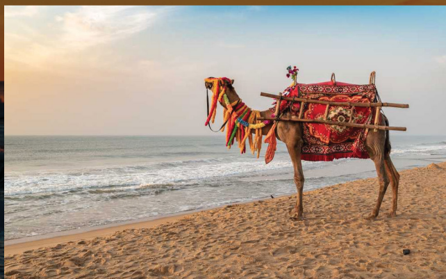
Puri Sea Beach